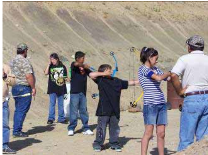
Archery at the Pistol Range