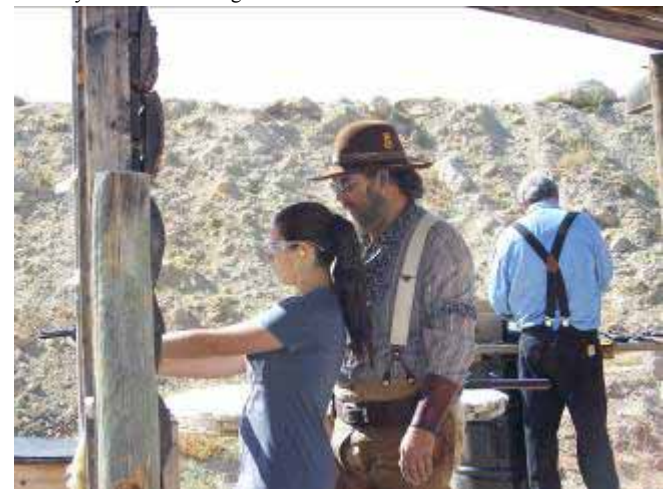
Pistols at the Pistol Range

OUR PLEDGE "I Pledge to Protect and Conserve the Natural Resources of America. I Promise to Educate Future Generations so They May Become Caretakers of Our Water, Air, Land, and Wildlife."