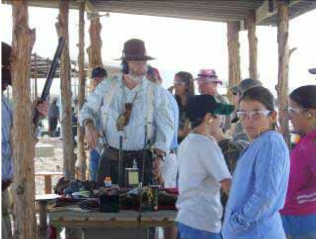
Many thanks to the volunteers, who know their stuff and are willing to share their time and skills with the kids of the four corners