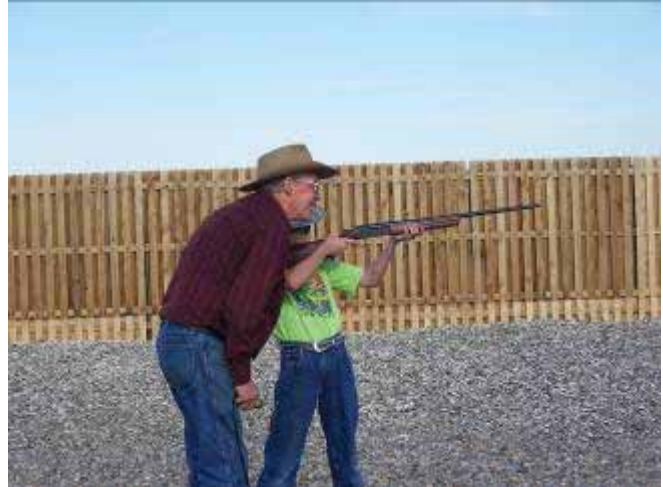
At the trap and skeet range