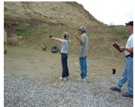
We definitely start them young!